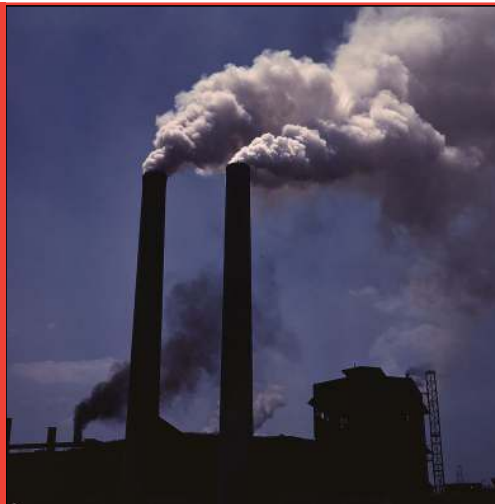
Smoke stacks