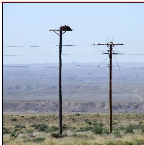
Nesting platform

CEQ defines a Categorical Exclusion (CATEX) as any "category of actions which do not individually or cumulatively have a significant effect on the human environment." Each agency may establish a CATEX within their adopted NEPA Implementing Procedures for any federal actions that, "based on past experience with similar actions, do not involve significant environmental impacts." Since these actions do not have a significant impact, "neither an environmental assessment nor an environmental impact statement is required." Examples of a CATEX activity for the Bureau of Land Management includes constructing nesting platforms for wild birds and constructing snow fences for safety.