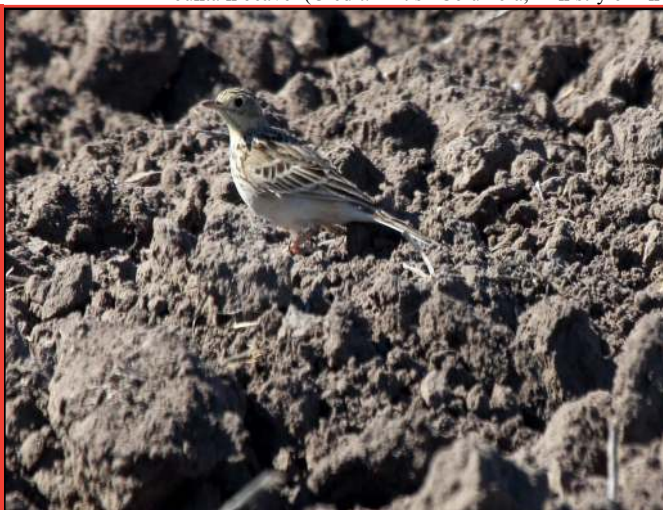
Sprague's pipit