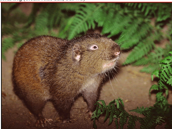
Mountain beaver

The mountain beaver ( Aplodontia rufa ) was reassessed and listed as special concern under SARA in 2012. The mountain beaver is found in British Columbia, but its range has decreased by 29 percent in the last 50 years due to habitat loss. Habitat destruction has been caused by soil compaction and disturbance by heavy machinery during forestry activities and urbanization. Federal and provincial governments created a management plan for the mountain beaver in 2013 to improve the abundance of the species in British Columbia. This will be achieved through the implementation of best management practices for timber harvesting in areas occupied by mountain beavers and conservation of other mountain beaver habitat. The goal is to prevent the mountain beaver from being listed as threatened under SARA.